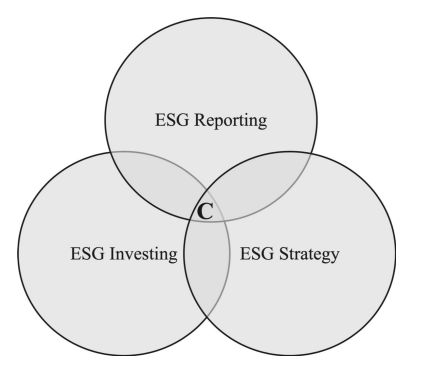
Figure 1: ESG Convergence (own illustration)

the (ideal) role of every participant in the ESG ecosystem and highlights their respective demand and supply side as well as their core activities for ESG integration.