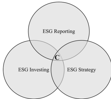
Figure 1: ESG Convergence (own illustration)

In an ideal world , the market participants of the ESG ecosystem would collaborate as outlined below in the joint pursuit to maximize the Convergence of ESG ('C') in the illustration above. The following abstract briefly explains the (ideal) role of every participant in the ESG ecosystem and highlights their respective demand and supply side as well as their core activities for ESG integration.